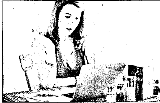
SAFE INSIDE: The software has been mathematically proven to operate correctly and can separate trusted from untrusted software

Its unique feature is that it has been mathematically proven to operate correctly, en-