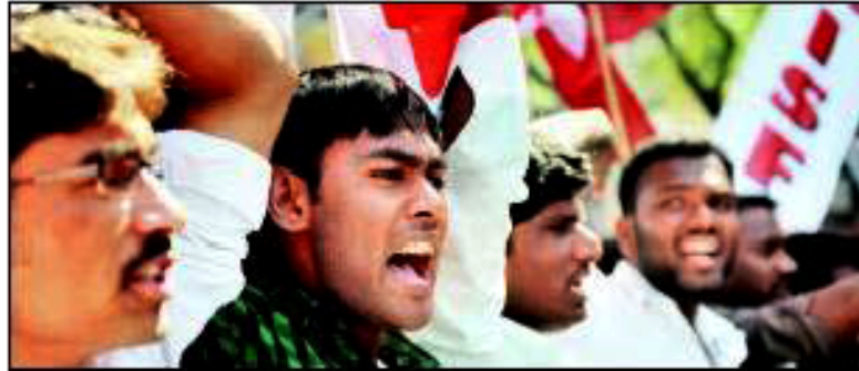
Students demonstrate against the California-based Tri-Valley University, near the US consulate in Hyderabad

A number of Indian students, who had been arrested have been dog-tagged by the US authorities with GPS trackers strapped on their bodies to